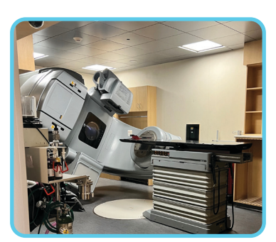
New radiation administration unit