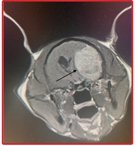
Figure 1: Transverse T-1 weighted, fat sat, post-contrast image of Misterz's mass.

Further ancillary testing consisted of a minimum database including CBC, serum chemistry and urinalysis. Significant abnormality was not noted. Magnetic resonance imaging was pursued on the cranial axis. Present on imaging is a large intradural-extra-axial mass lesion (figure 1). This lesion was oblong and globoid in shape, occupying a markedly right lateralized nature with mass-effect including compression of the right lateral ventricle, subfascial and caudal transtentorial herniation with secondary foraminal herniation. A meningeal tailing was evident on post-contrast studies. The associated mass measured 1.54 x 1.6 x 1.25 cm in size.